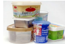
Plastic Food Containers