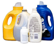
Plastic Jugs & Bottles